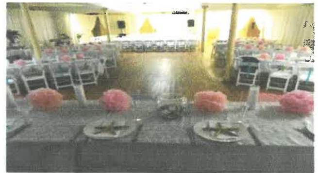
St. Peter Claver Lower Church Hall