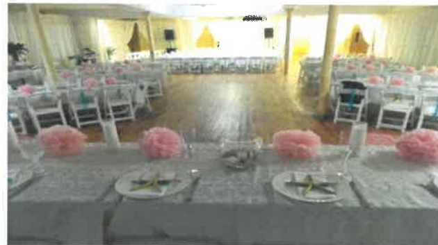
St. Peter Claver Lower Church Hall