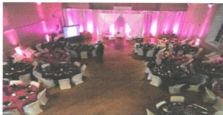
Our Lady of Victory McGuinness Hall