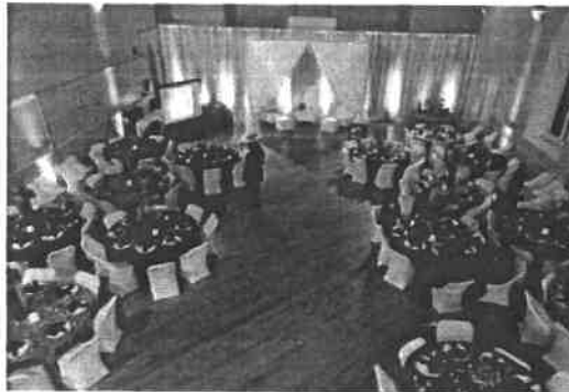
Our Lady of Victory McGuinness Hall