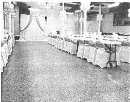
Holy Rosary Lower Church Hall