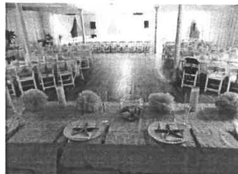
St. Peter Claver Lower Church Hall