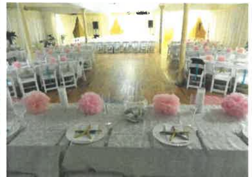
St. Peter Claver Lower Church Hall