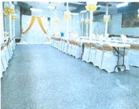
Holy Rosary Lower Church Hall