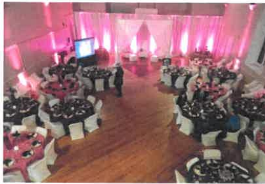
Our Lady of Victory McGuinness Hall