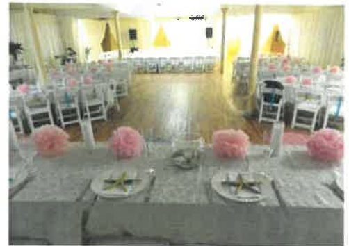
St. Peter Claver Lower Church Hall