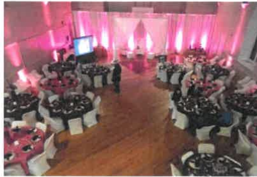
Our Lady of Victory McGuinness Hall