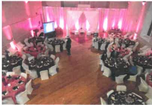
Our Lady of Victory McGuinness Hall