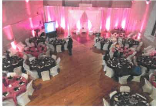
Our Lady of Victory McGuinness Hall