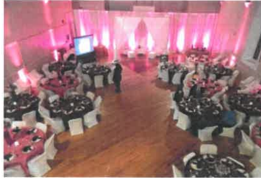
Our Lady of Victory McGuinness Hall