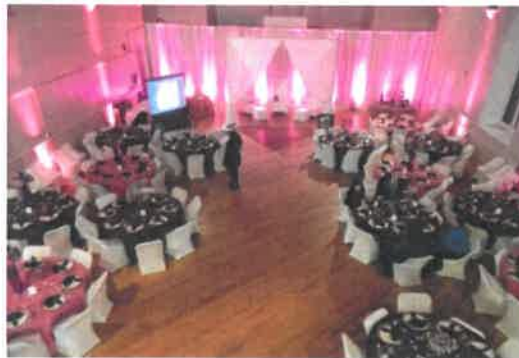
Our Lady of Victory McGuinness Hall