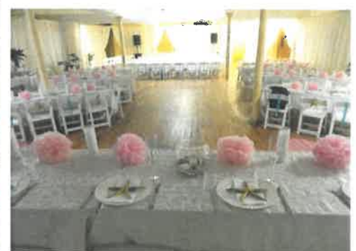
St. Peter Claver Lower Church Hall