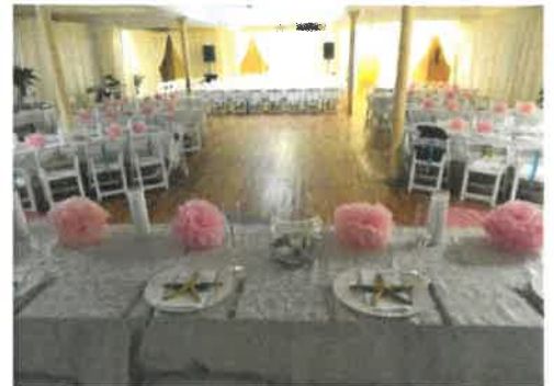
St. Peter Claver Lower Church Hall