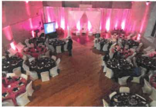
Our Lady of Victory McGuinness Hall