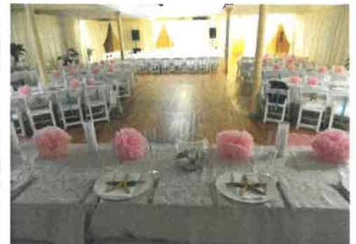
St. Peter Claver Lower Church Hall