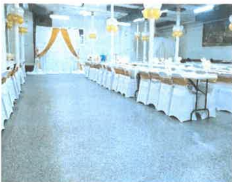
Holy Rosary Lower Church Hall