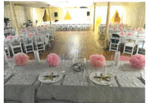
St. Peter Claver Lower Church Hall