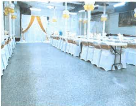
Holy Rosary Lower Church Hall