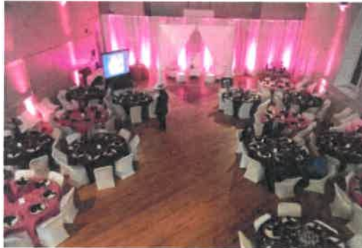
Our Lady of Victory McGuinness Hall