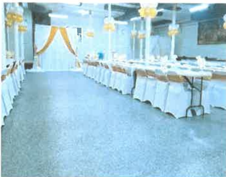
Holy Rosary Lower Church Hall