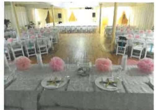
St. Peter Claver Lower Church Hall