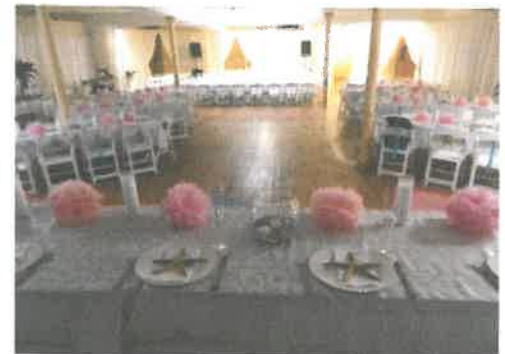
St. Peter Claver Lower Church Hall