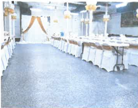
Holy Rosary Lower Church Hall