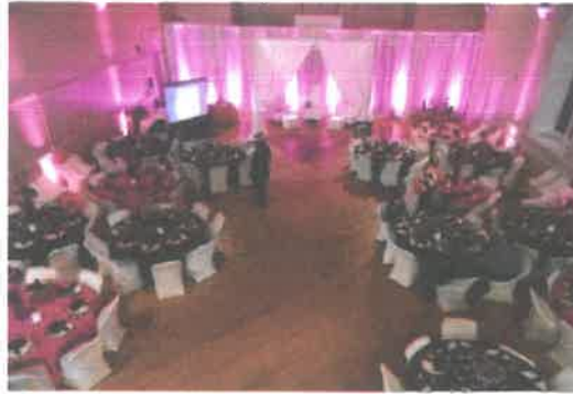
Our Lady of Victory McGuinness Hall