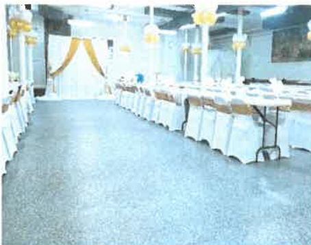
Holy Rosary Lower Church Hall