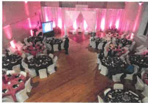
Our Lady of Victory McGuinness Hall