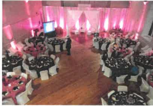
Our Lady of Victory McGuinness Hall