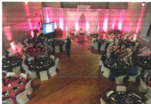
Our Lady of Victory McGuinness Hall