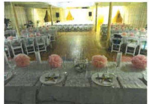
St. Peter Claver Lower Church Hall