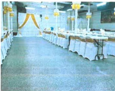
Holy Rosary Lower Church Hall