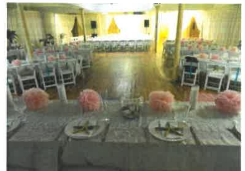
St. Peter Claver Lower Church Hall