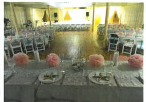
St. Peter Claver Lower Church Hall