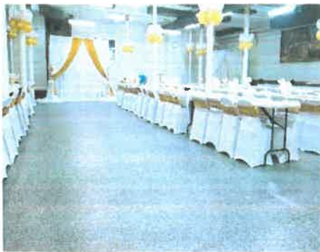
Holy Rosary Lower Church Hall