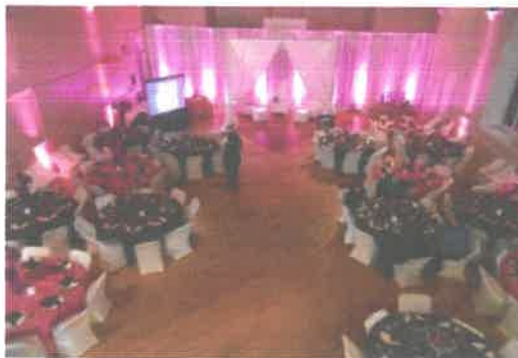
Our Lady of Victory McGuinness Hall