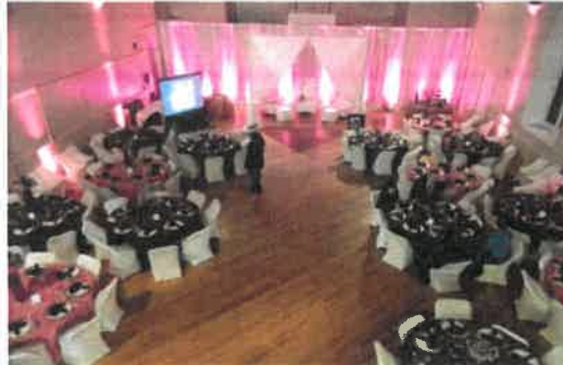
Our Lady of Victory McGuinness Hall