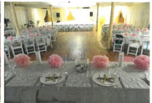
St. Peter Claver Lower Church Hall