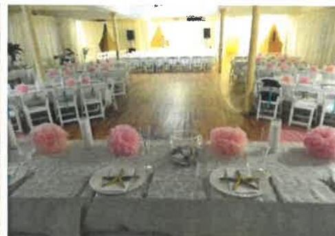
St. Peter Claver Lower Church Hall