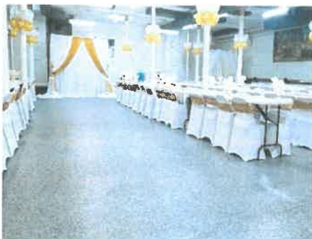
Holy Rosary Lower Church Hall