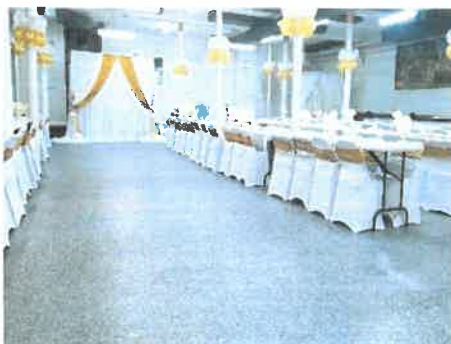
Holy Rosary Lower Church Hall