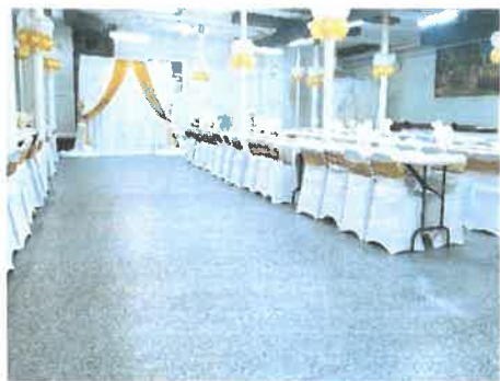
Holy Rosary Lower Church Hall