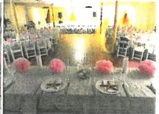
St. Peter Claver Lower Church Hall