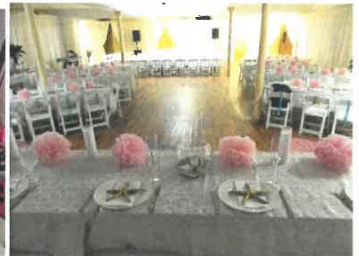
St. Peter Claver Lower Church Hall