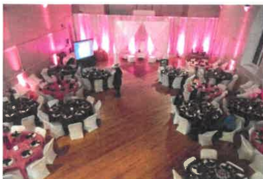
Our Lady of Victory McGuinness Hall