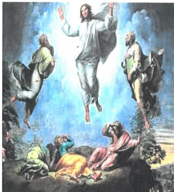
The Transfiguration of the Lord.

Sat. Dt 6:4-13 Ps18:2-3a, 3bc-4, 47& 51 Mt 17:14-20