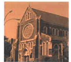
Our Lady of Victory Church 583 Throop Avenue Brooklyn, NY 11216

Mass Schedule Sundays: 9 AM Tuesdays: 11 AM