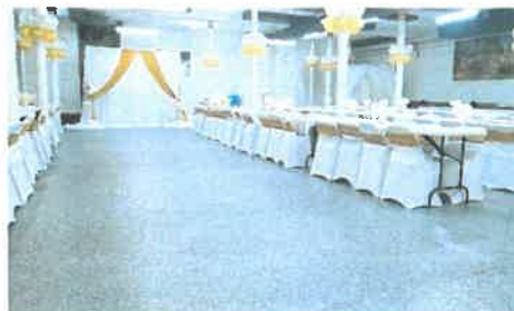
Holy Rosary Lower Church Hall