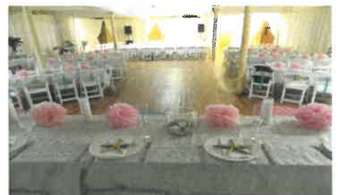
St. Peter Claver Lower Church Hall