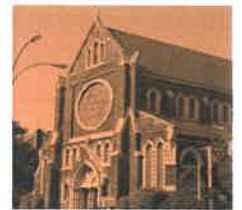
Our Lady of Victory Church 583 Throop Avenue Brooklyn, NY 11216

Mass Schedule Sundays: 9 AM Tuesdays: 11 AM