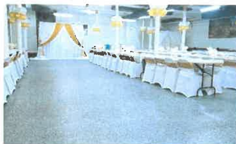
Holy Rosary Lower Church Hall