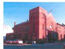
St. Peter Claver Church 29 Claver Place Brooklyn, NY 11238

Mass Schedule Sun.: 7:30 AM & 10:15 AM Mon. to Fri.: 8 AM (in St. Anthony's Chapel)