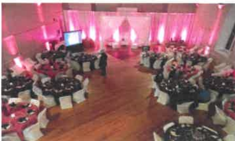
Our Lady of Victory McGuinness Hall