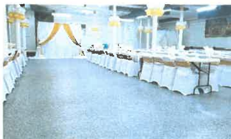
Holy Rosary Lower Church Hall