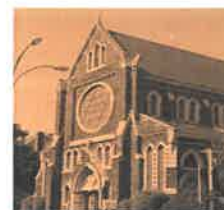
Our Lady of Victory Church 583 Throop Avenue Brooklyn, NY 11216

Mass Schedule Sundays: 9 AM Tuesdays: 11 AM