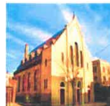
Holy Rosary Church 139 Chauncey Street Brooklyn, NY 11233

Mass Schedule Sundays: 9 AM Tuesdays: 11 AM