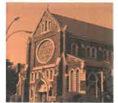
Our Lady of Victory Church 583 Throop Avenue Brooklyn, NY 11216

Mass Schedule Sundays: 9 AM Tuesdays: 11 AM