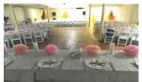
St. Peter Claver Lower Church Hall