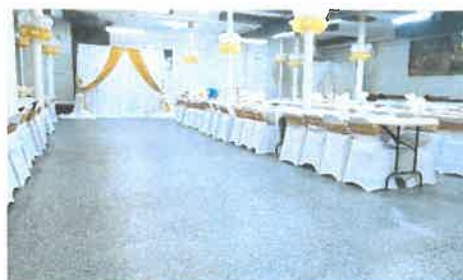
Holy Rosary Lower Church Hall