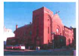
St. Peter Claver Church 29 Claver Place Brooklyn, NY 11238

Mass Schedule Sun.: 7:30 AM & 10:15 AM Mon. to Fri.: 8 AM (in St. Anthony's Chapel)