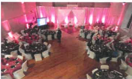
Our Lady of Victory McGuiness Hall