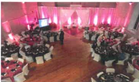
Our Lady of Victory McGuiness Hall