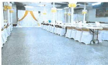
Holy Rosary Lower Church Hall