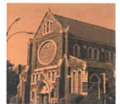
Our Lady of Victory Church 583 Throop Avenue Brooklyn, NY 11216

Mass Schedule Sundays: 9 AM Tuesdays: 11 AM