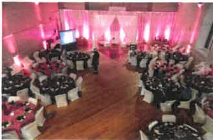
Our Lady of Victory McGuinness Hall