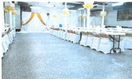
Holy Rosary Lower Church Hall