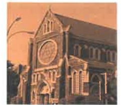
Our Lady of Victory Church 583 Throop Avenue Brooklyn, NY 11216

Mass Schedule Sundays: 9 AM Tuesdays: 11 AM