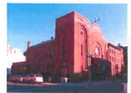
St. Peter Claver Church 29 Claver Place Brooklyn, NY 11238

Mass Schedule Sun.: 7: 30 AM & 10: 15 AM Mon. to Fri.: 8 AM (in St. Anthony's Chapel)