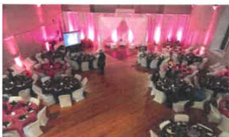
Our Lady of Victory McGuiness Hall

718-771-2305 or e-mail him at ggc4729@gmail.com