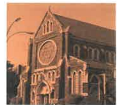
Our Lady of Victory Church 583 Throop Avenue Brooklyn, NY 11216

Mass Schedule Sundays: 9 AM Tuesdays: 11 AM