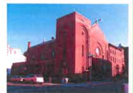
St. Peter Claver Church 29 Claver Place Brooklyn, NY 11238

Mass Schedule Sun.: 7: 30 AM & 10: 15 AM Mon. to Fri.: 8 AM (in St. Anthony's Chapel)