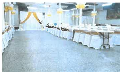
Holy Rosary Lower Church Hall