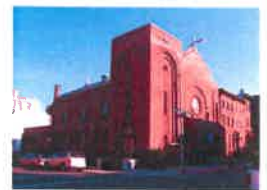
St. Peter Claver Church 29 Claver Place Brooklyn, NY 11238

Mass Schedule Sun.: 7: 30 AM & 10: 15 AM Mon. to Fri.: 8 AM (in St. Anthony's Chapel)